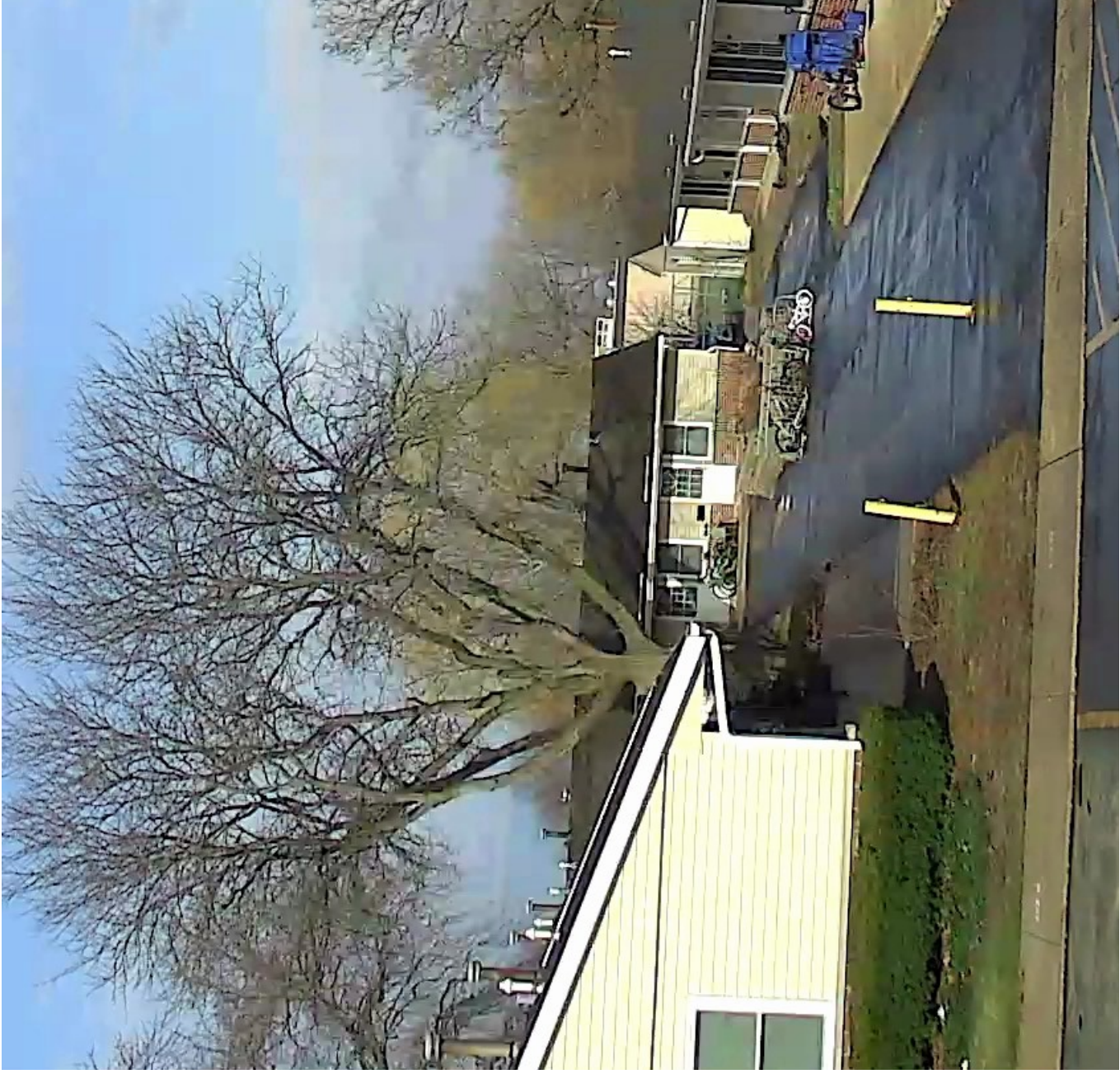
One (1) Large Tree next to Building 105-106