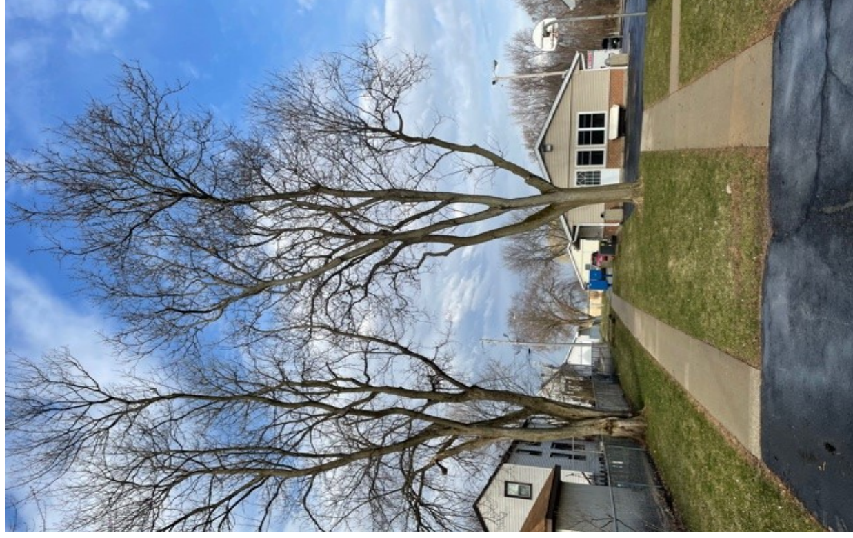
Two (2) Large Trees East of Clubhouse