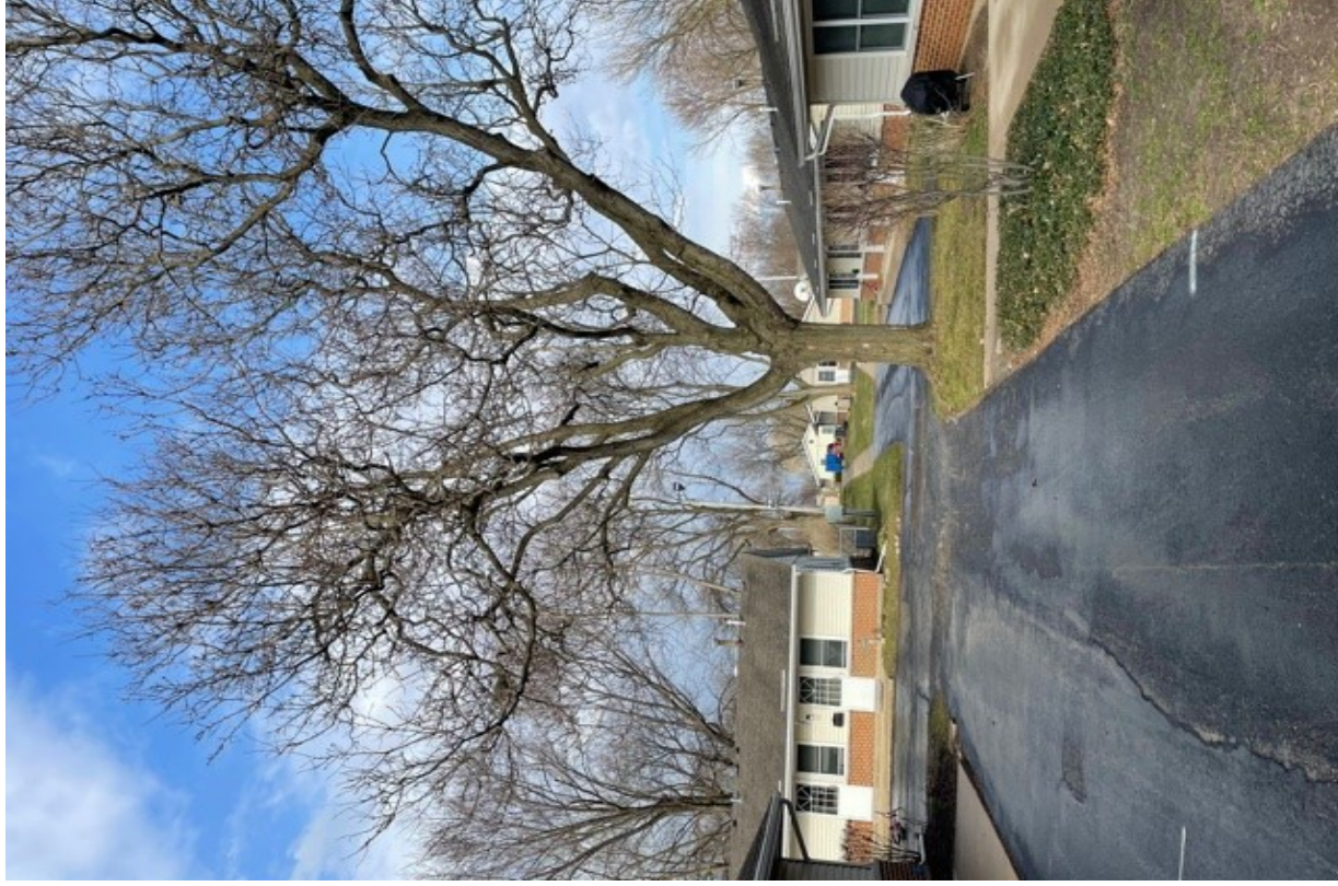
One (1) Large Tree next to Building 211-212